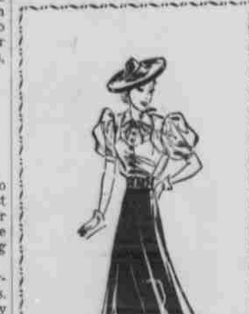
Gibson girl effect dress with an adaptation of the Mexican sombrero.

Sombody could get rich selling cotton stockings if he would advertise them thus: "Cotton stockings are more durable, economical and comfortable than stockings made of silk, but they are not flattering. They are recommended only for girls with trim and shapely legs."