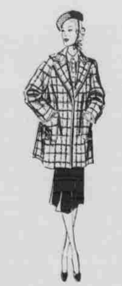
Finger-tip bright plaid box coat worn with the pill-box hat.