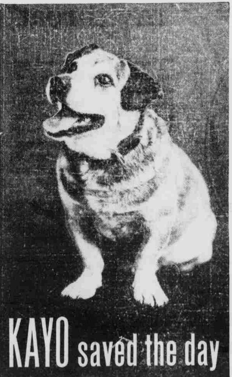
KAYO saved the day

A CHURNING flood had taken out the telephone line across a Colorado stream. Repairs couldn't wade it because of quicksand—couldn't cross elsewhere and bring back the line because of obstructions.