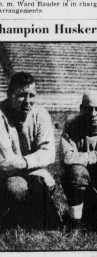
Here are four fingers of the hand of fate in which rests the destiny of the 1936 Cornhusker grid squad.