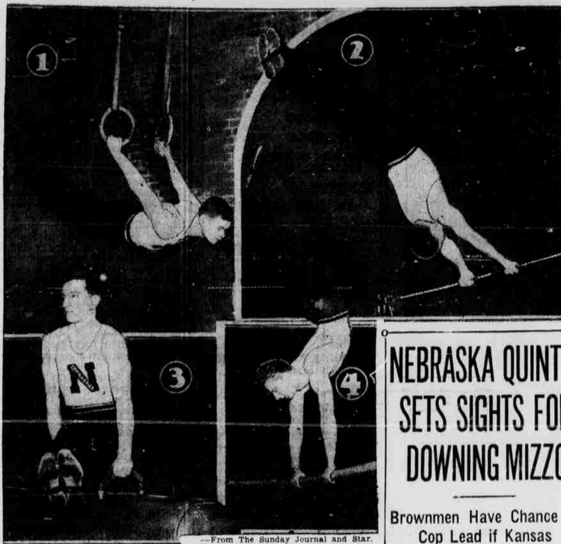
From The Sunday Journal and Star.

Nebraska's gymnastic team is in its second year of intercollegiate competition and is doing right well. There are four meets remaining of the schedule, two in Lincoln against Missouri and Kansas State.