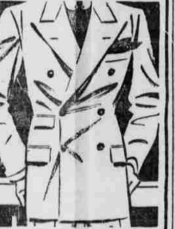
The cash flap is new.

The new double breasted drape that is being worn by the smartly dressed Easterner is more becoming in every way and easier to wear than the coat as originally designed. A greater fullness at the chest and shoulder blades makes for complete ease, but the most distinguishing change on this style is the wider placement of the buttons.