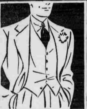
Plaited trousers go with the Draps.

For this spring the success of the Talon closing device is assured. No man who has experienced the neater effect, the more tailored appearance this gives his trousers will ever go back to the old construction.