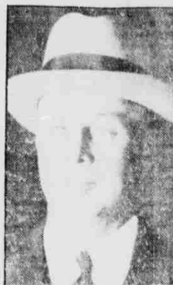
Coach Dana N. Bible, football mentor at Nebraska, who started grooming his charges for another Big Six title this week. It is Bible's fifth year as head coach at Nebraska. During his four year regime, Bible's teams have won three Big Six conference championships.

on this campus, with a much wider scope of boys than just football players included.