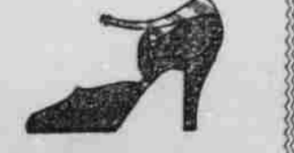
The One-Strap—a favorite for informal dancing.