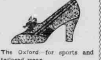
The Oxford—for sports and tailored wear.