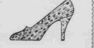
The pump—to complement dainty afternoon frocks.