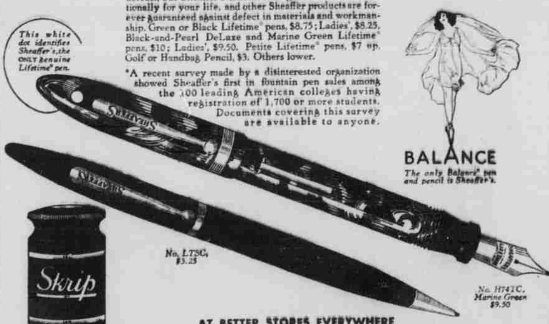
No. L75C, $3.25

*A recent survey made by a disinterested organization showed Sheaffer's first in fountain pen sales among the 100 leading American colleges having registration of 1,700 or more students. Documents covering this survey are available to anyone.