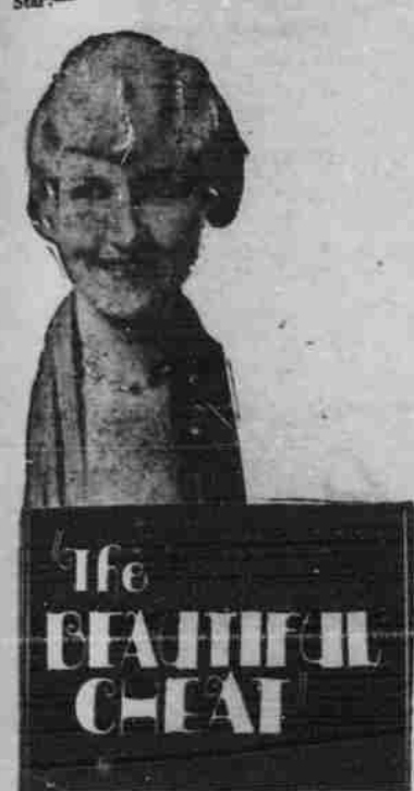
Photo. - 2:20, 6:50, 10:20 She'll keep you laughing merrily in this selightful comedy of the rise of a Movie