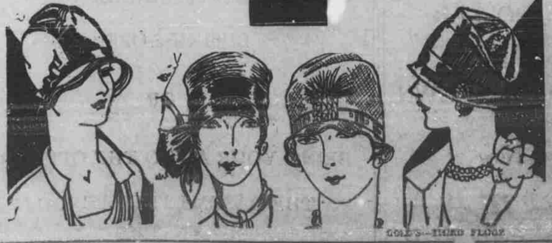
GOLD'S THIRD FLOOR

See windows—and come early for first choice. Plenty of sales-people.