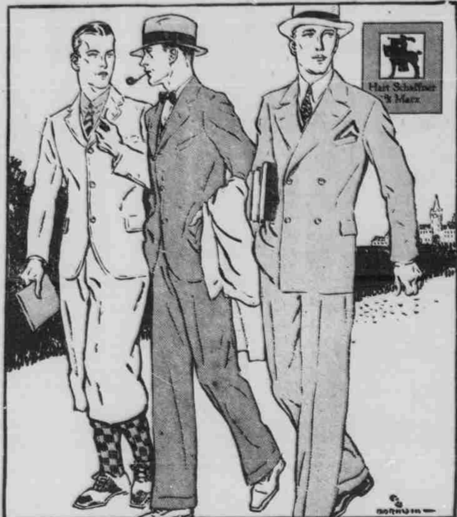
Copyright 1925 Hart Schaffner & Marx

Your new suit ought to make you look taller, huskier