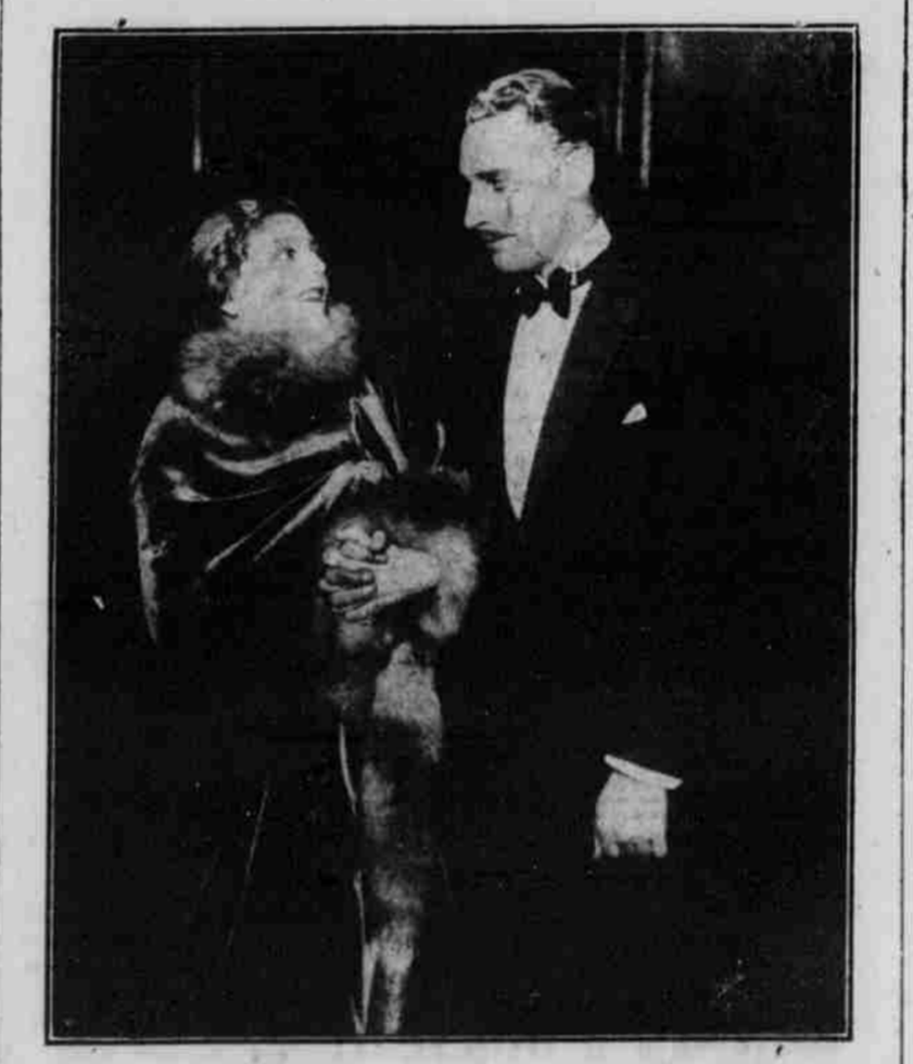
ETHEL BARRYMORE in "The Second Mrs. Tanqueray," at the Orpheum tomorrow nite.—Advertisement.