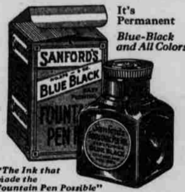
"The Ink that Made the Fountain Pen Possible"