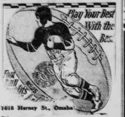
1618 Harney St., Omaha