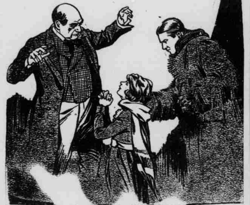
Fourth Annual Showing

Here you have something more than a motion picture—it is a story of human hearts, unfolded in a simple, soul-reaching way, under the master guidance of Mr. Griffith—a production that will go thundering down the ages just because it is so human.