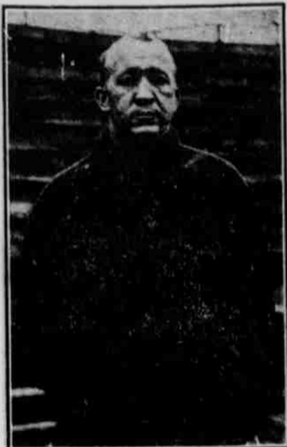
COACH KNUTE K. ROCKNE.

In the intercollege meet the Agricultural college took first place, the Bizads second, Arts and Science third, Laws fourth, and Engineers fifth.