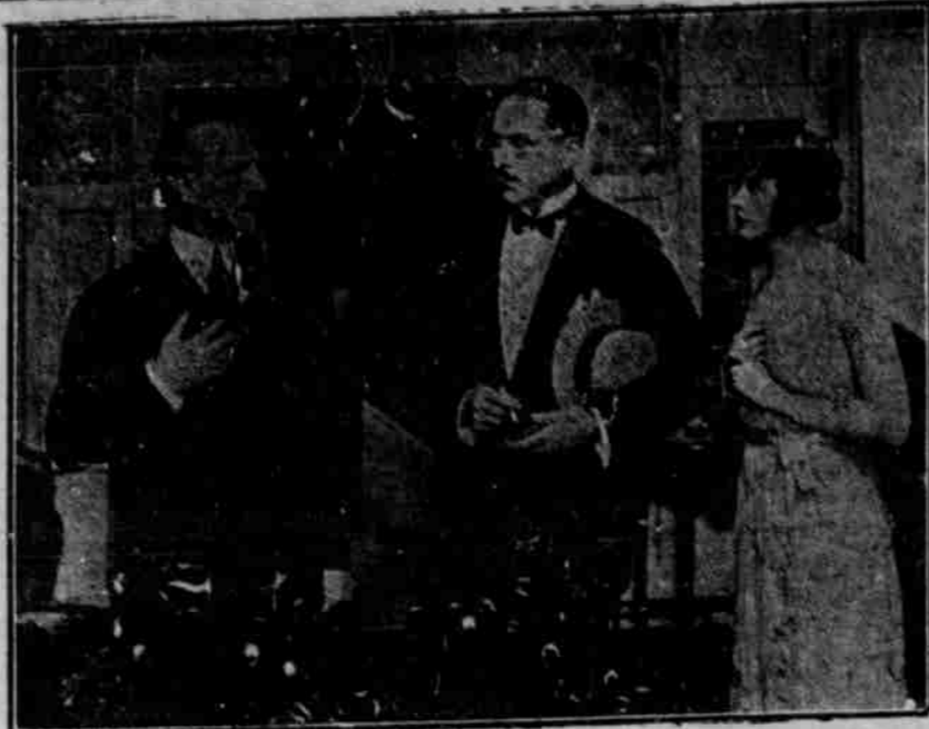
Scenes of first act "The Bat" at the Orpheum, Saturday matinee and night, September 29.