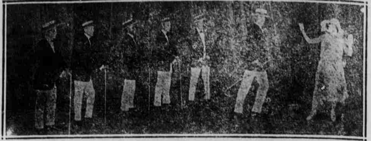
Cane dancing steppers with the sensational musical comedy "Shuffle Along" which will be at the Orpheum Theater Tuesday and Wednesday April 10th and 11th with a special matinee Wednesday afternoon.

ELECTRIC Light Vanity Boxes. See them at Photo Specialty House.