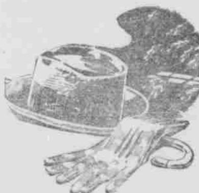
Get Him a Knox or Stetson Hat for his Xmas.

In reality, slippers for every need. Slippers to slip on with the bath robe—slippers to wear during lounging hours—slippers for the Pullman. A chance to select just the sort of slippers he will enjoy and use most.