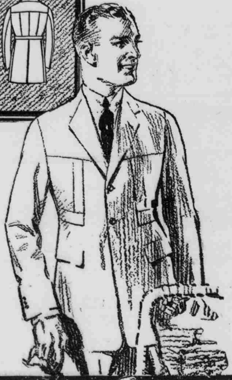
—Clothes Designed by Kaufman