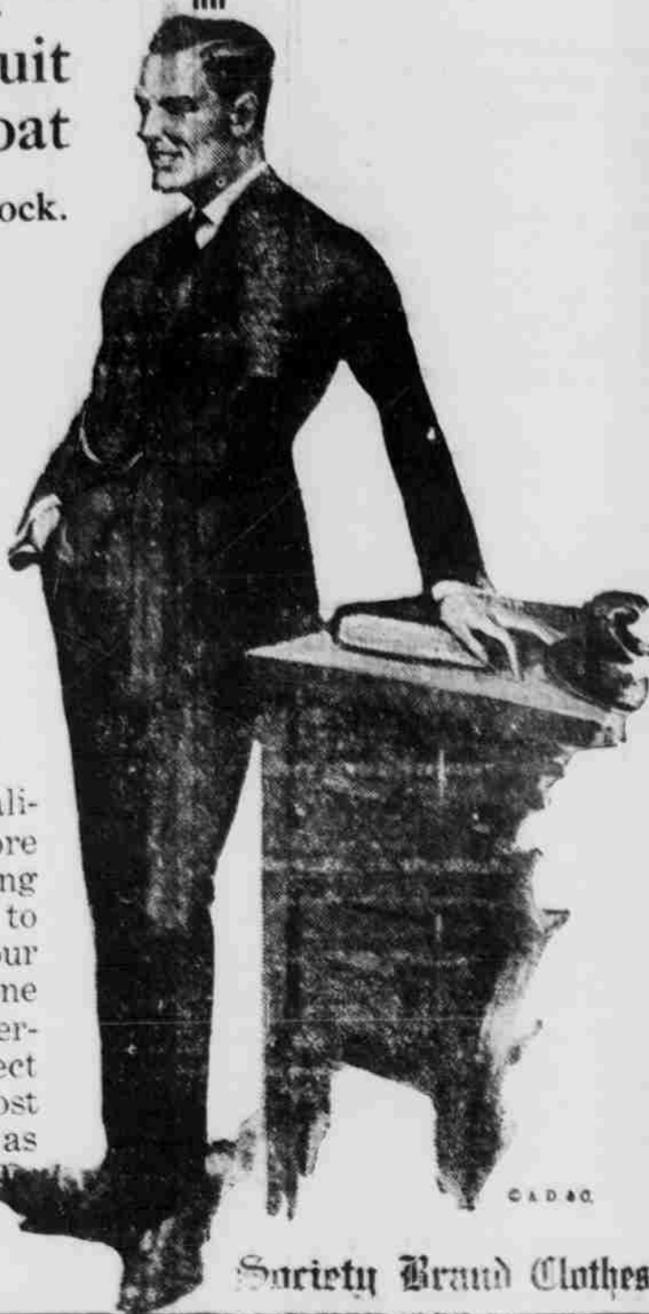
Society Brand Clothes

We foster better quality, better tailoring, more distinctive style, enduring service and our ability to match the garment to your personality is a foregone conclusion here. Our experiences, judgment of correct style safeguards the most exacting, supercritical as well as the interest of the "easy-buys."