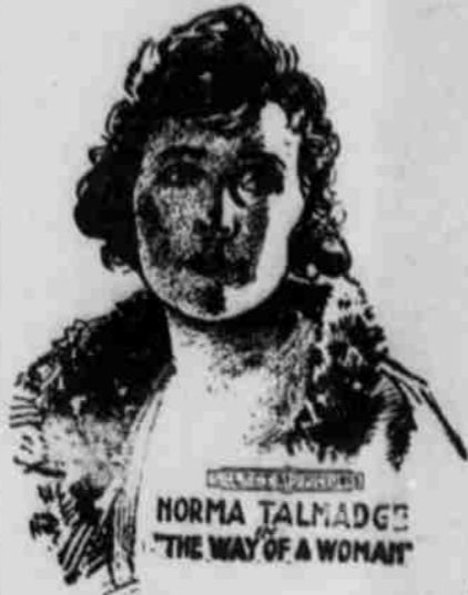
AT THE RIALTO THIS WEEK END