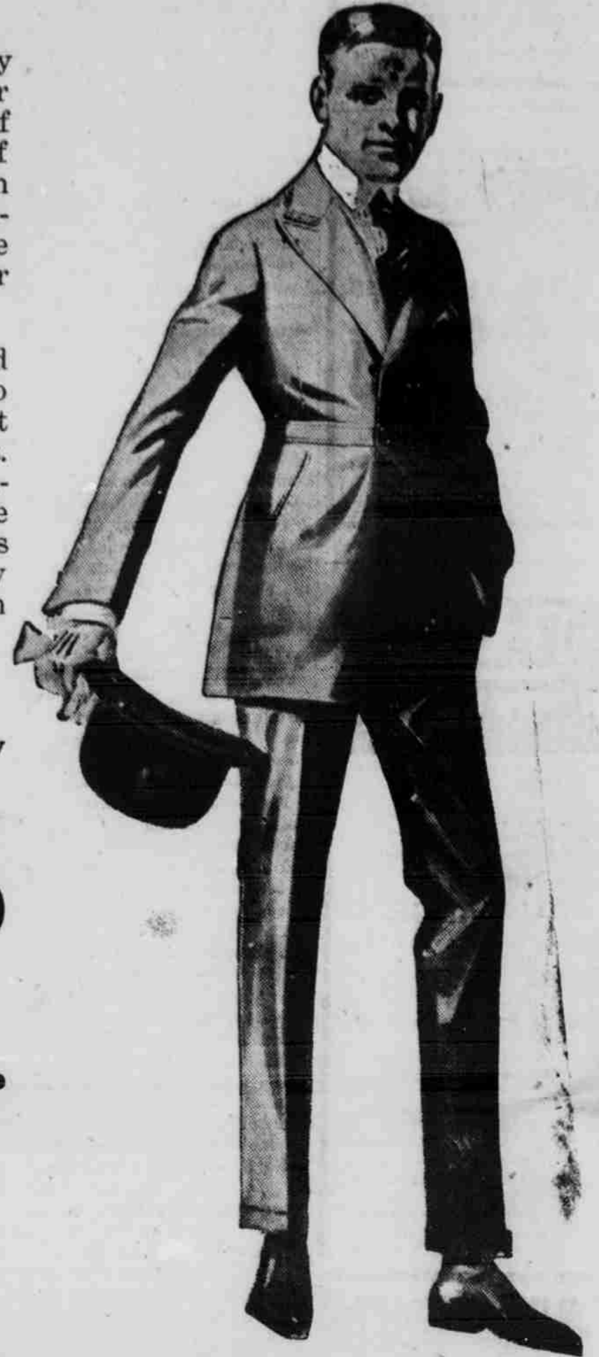
Society Brand Clothes

This store is prepared to plant the good clothes habit in the mind of youth, and to supply the quality of clothes to perpetuate that habit in men who have already formed it. We're just tingling all over to have you good-dressers, and want-to-be-good-dressers come in and admire these Society Brand Clothes which, in every fiber of materials and every stitch of making, are the best that brains can produce.