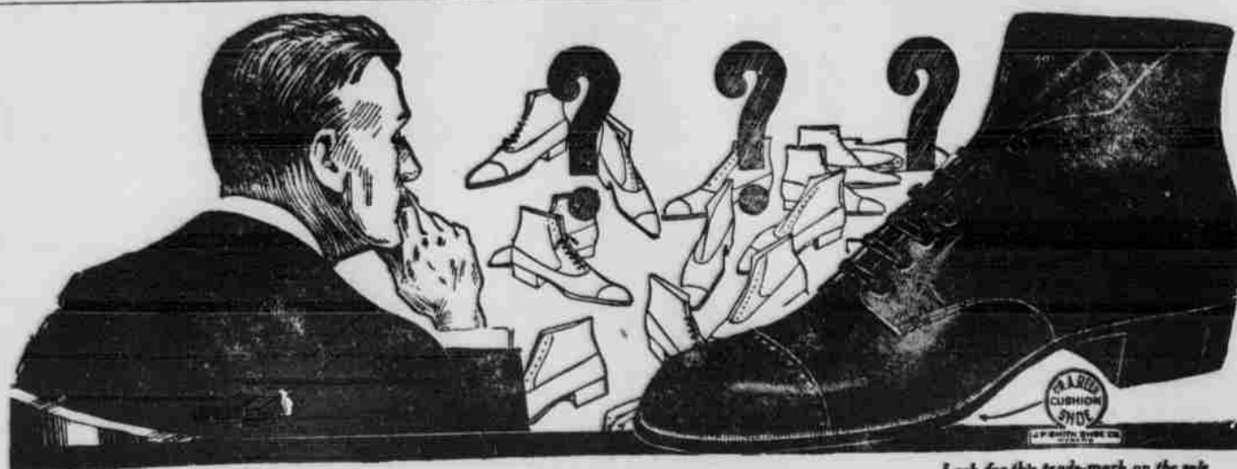
Look for this trade-mark on the sole