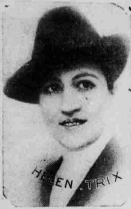
At THE ORPHEUM Wed., Thur., Fri. and Sat.

Three Shows Daily, 2:30, 7:00, 9 Mats.—15c Night—15c and 25c