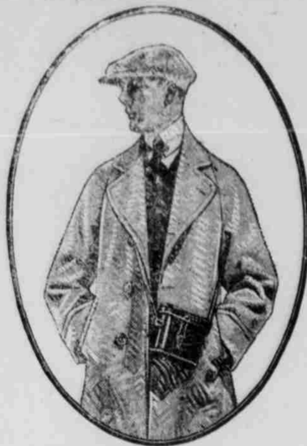
Copyright 1918 The House of Kuppenheimer

Local Humor R. O. T. C. Officer: "You'd better wear rubber soles to drill today." Rook: "Why?" R. O. T. C. Officer: "So I can't hear when you're out of step."—Minnesota Daily.