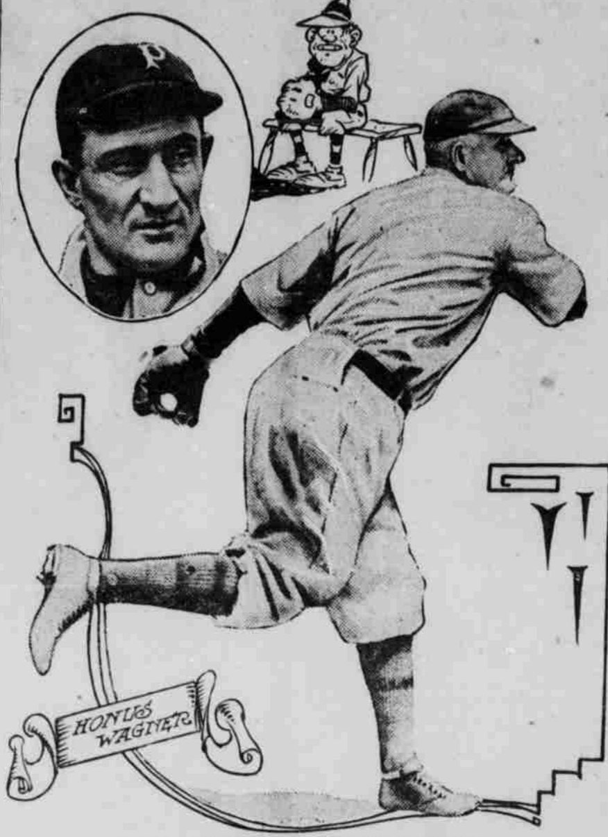
BEST PLAYER GAME HAS EVER KNOWN.

A few years ago it was thought wonderful when Cy Young started on his twenty-fourth year in baseball, but old Cy didn't finish. It also was thought Matty was going to last forever, but his pitching years were limited to 16. Now Honus Wagner of the Pittsburgh Pirates steps out on completion of 25 years in the game.