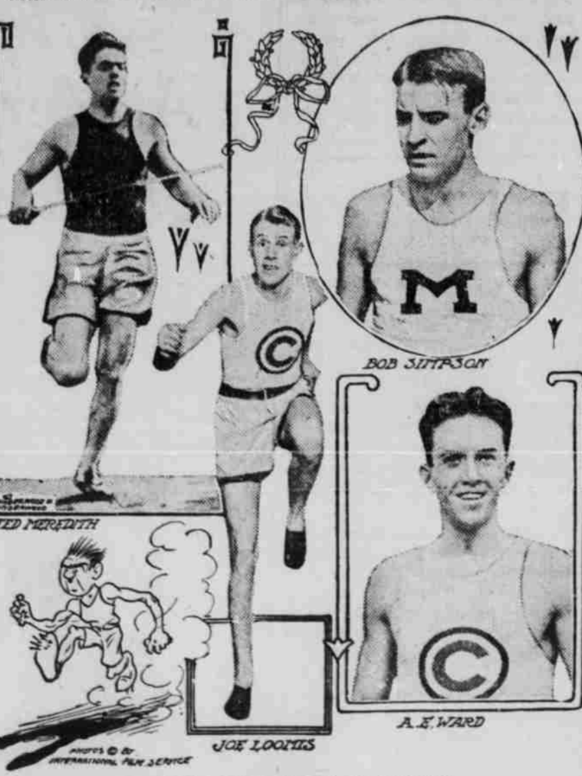
BRILLIANT PERFORMERS IN SWEDEN.