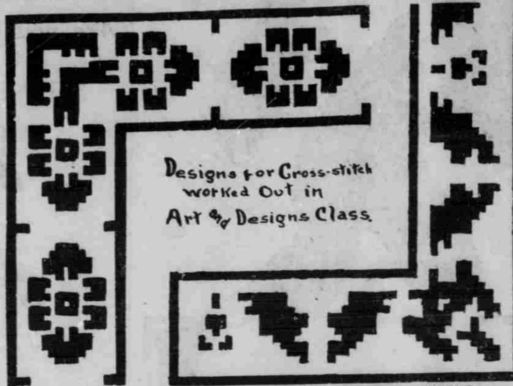
Designs for Cross-stitch worked out in Art and Design Class.