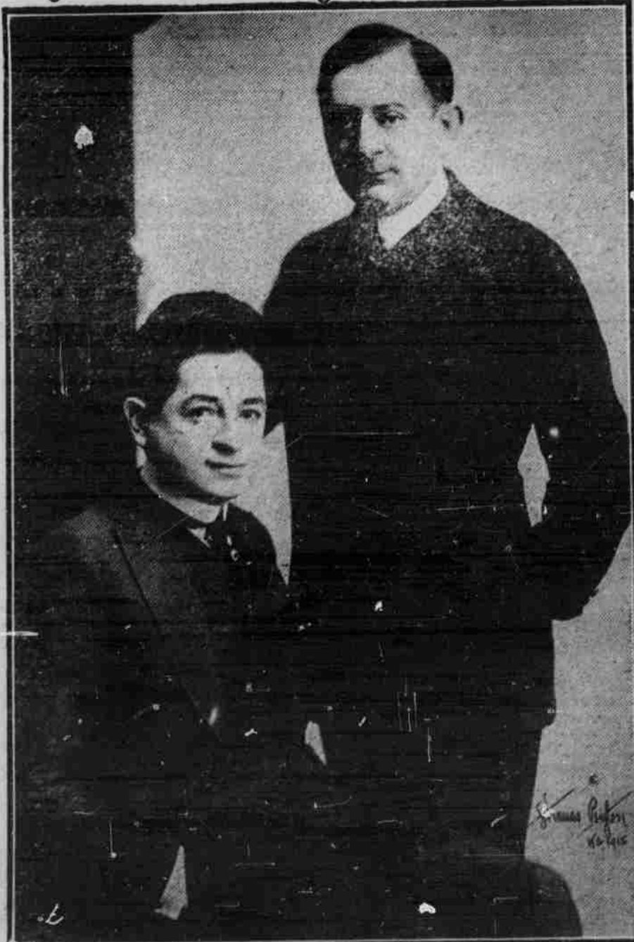
EUGENE AND WILLIE HOWARD in "THE PASSING SHOW OF 1915," at the Oliver, Saturday Matinee and Night, April 22nd. The last musical attraction of the season.