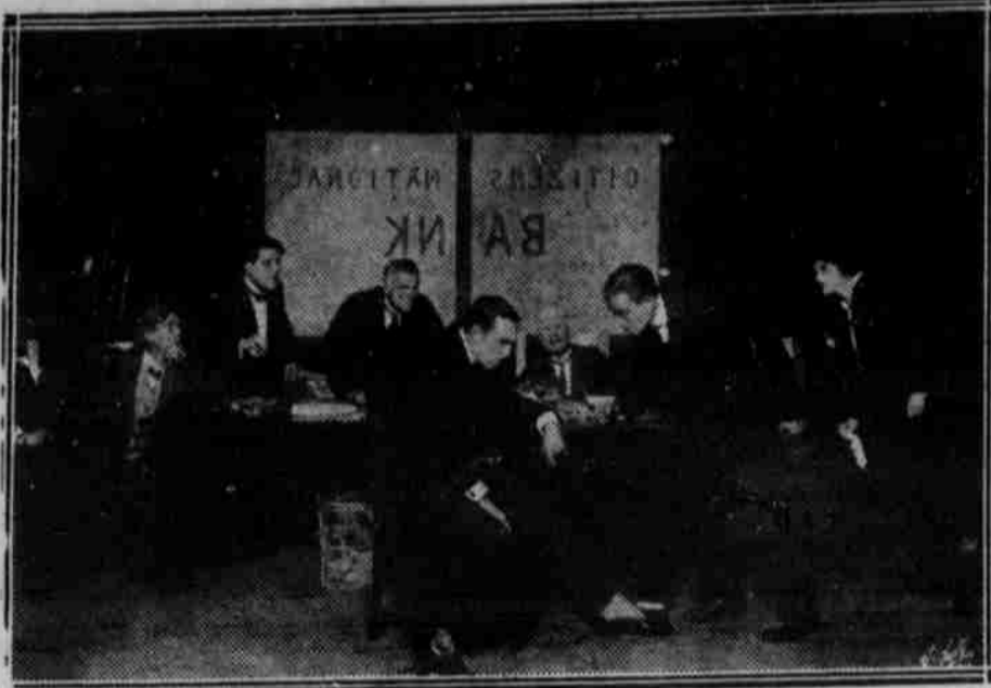
Paul Armstrong's Comedy Playlet, "THE BANK'S HALF MILLION," One of the Features of the Popular Orpheum Vaudeville This Week