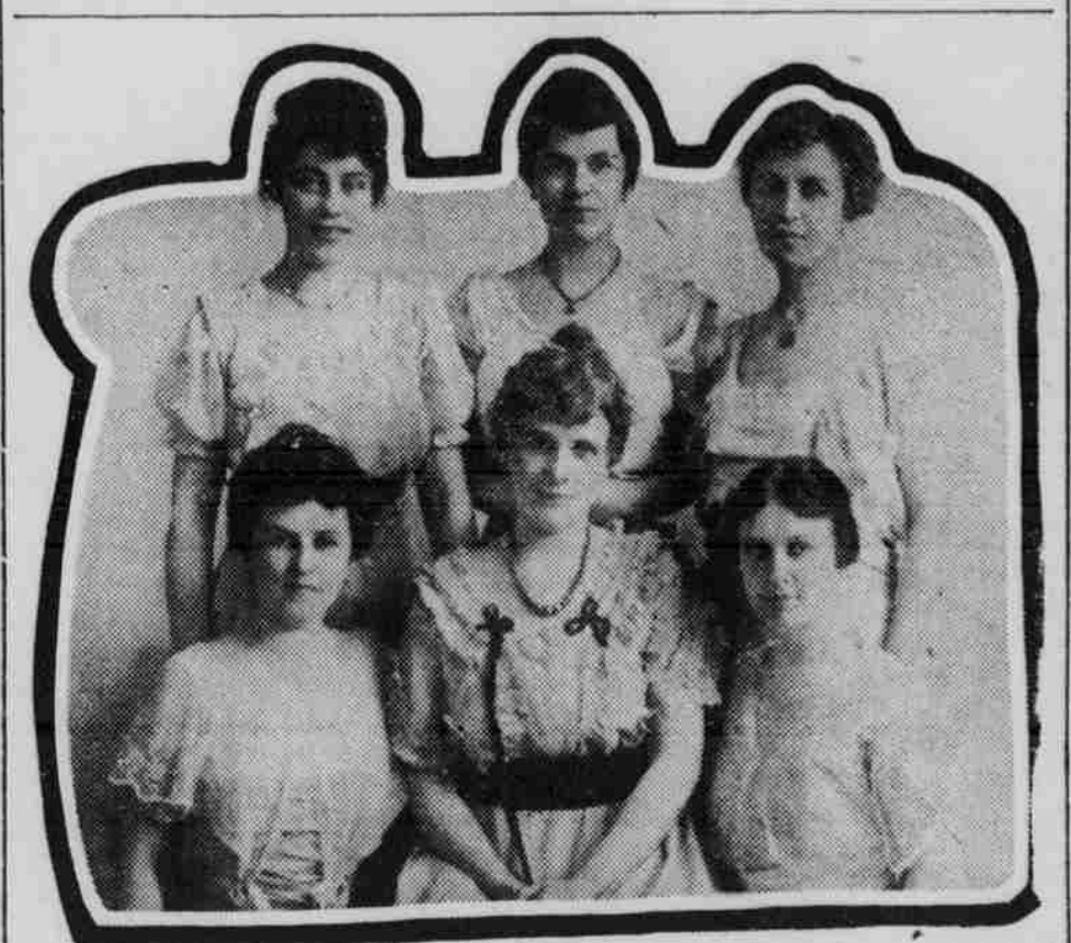
Six of the SIXTEEN NAVASSAR GIRLS Headliners at the Orpheum This Week