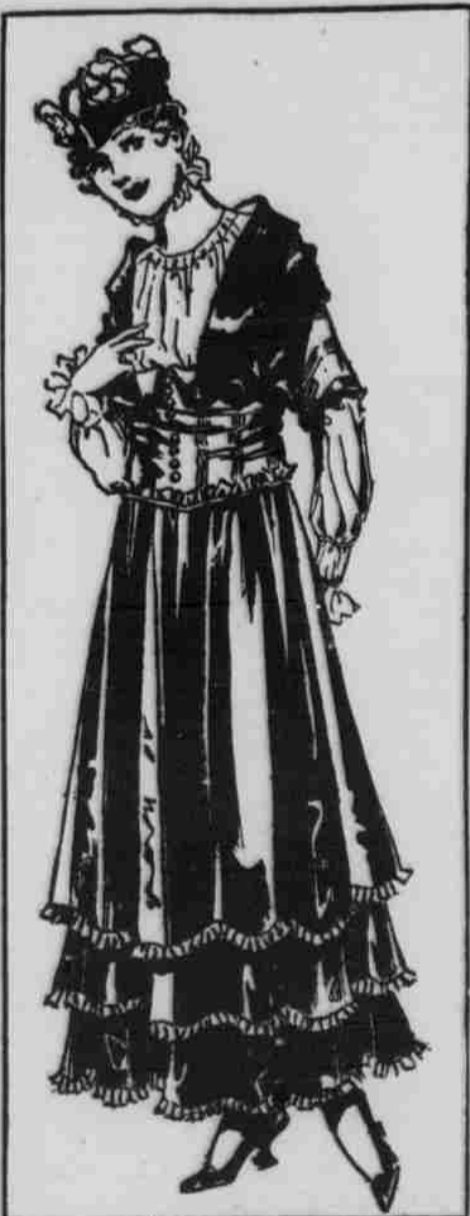
Splendid Design for Seal Brown Taffeta.

The tunic is a little below knee length, and similarly bordered with a narrow plaiting. Unlike the two