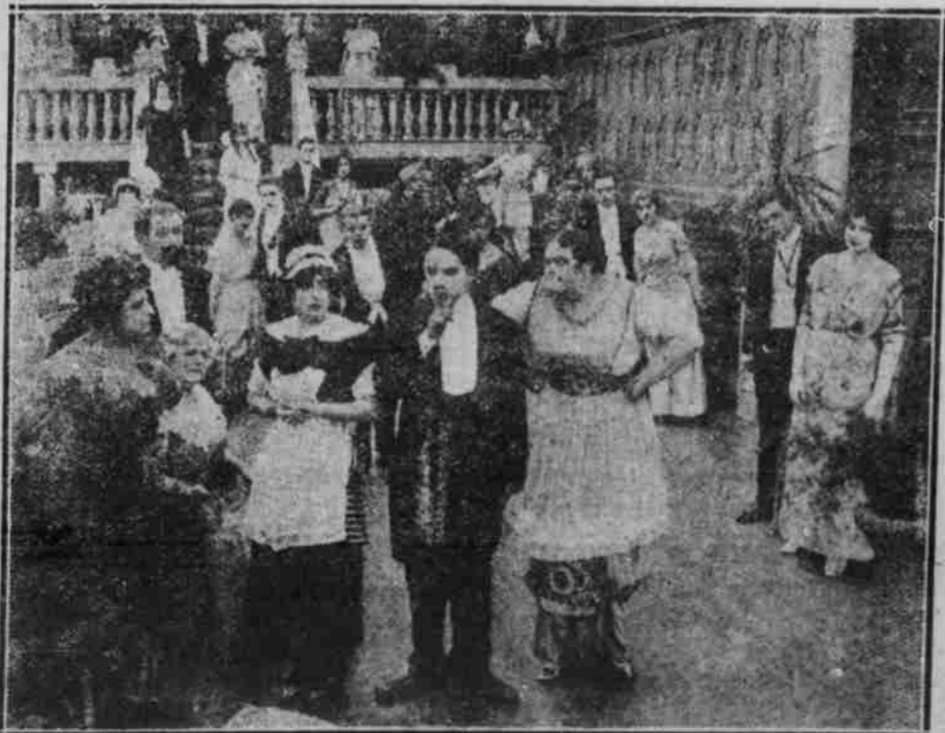
Maries Dressler, Charlie Chaplin, Ma bel Normand in the Six Reel Keystone Comedy

Tillies Punctured Romance At the Oliver—All This Week—3 Times Daily