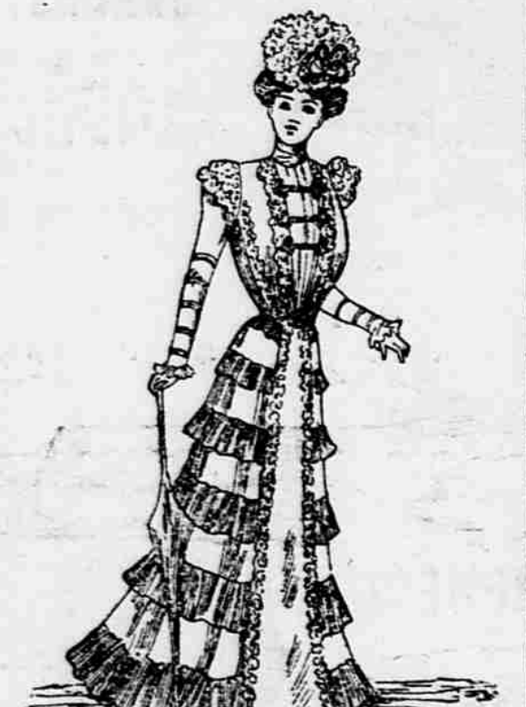
IN PATRIOTIC HUES.

The lower of these three was styled a race meet gown by its designer, but in general service would prove a very swaggy afternoon dress. Nothing is better suited, however, to an interested observer—hether of home-coming recruit or winning jockey, it makes lit-