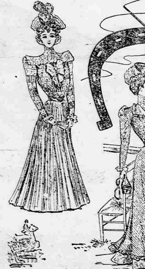
FINE FEATHERS FOR SUMMER.

There's another point that makes the summer girl anxious to look her best; she's convinced that the soldier boys will be home before the time for laying away warm weather finery. If she