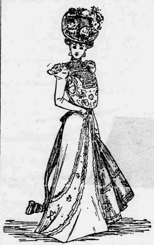
FIT FOR AN HEIRLOOM.

The third of these was a summer promenade dress. Follow this design,