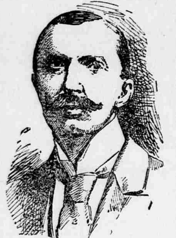
SIR GEORGE TAUBMAN GOLDIE.

Sir George Taubman Goldie, whose cable from Africa to London tells of the completion of the conquest of the Emir of Nupe, the great slave murderer, left for the Niger country a year ago with the prediction on his lips that he would forever settle the slave question in that part of Africa or leave his corpse in the country. The fact that he has accomplished what he set out to do is a victory for humanity as well as for the Royal Niger Company. The palace of the Emir is in the possession of Sir George's soldiers, and the Fulah power is dead. Incidentally, England has added largely to her territory in Africa. Sir George for years brooded in his London office over the work he has just accomplished. Just before his