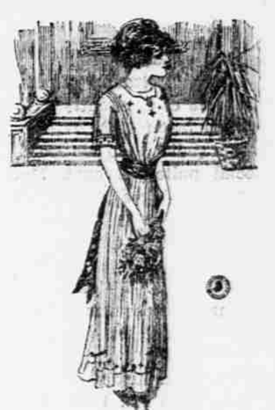
The Ladies' Home Journal Pattern No. 5807