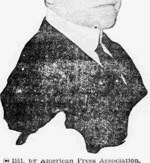
SENATOR DAVIS ELKINS.

Davis Elkins, who has been named by Governor Glascock of West Virginia to fill the senatorial vacancy caused by the death of his father, Stephen B. Elkins, until the legislature meets, is cited as an example of a rich man's son who has not been spoiled by wealth. Though but thirty-five years of age and therefore one of the