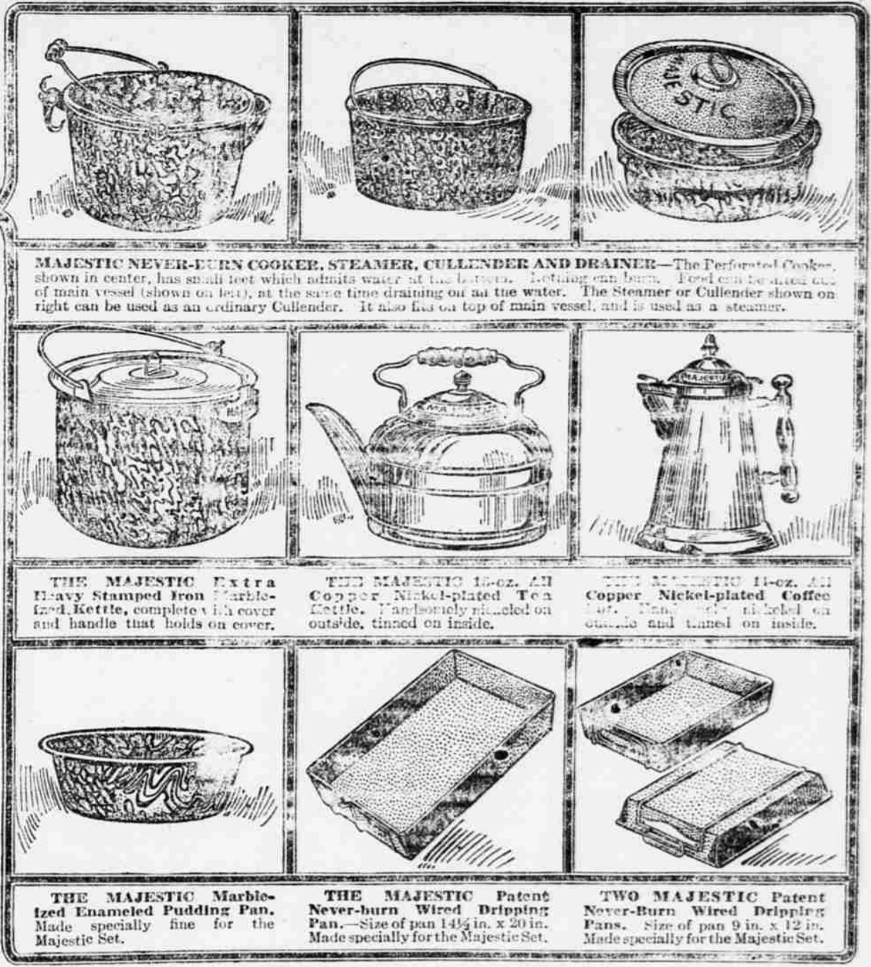
MAJESTIC NEVER-BURN COOKER, STEAMER, CULLENDER AND DRAINER—The Performed Cooker, shown in center, has small hole which admits water at low level. It stands on legs. The large size of main vessel (shown on left), at the same time draining off all the water. The Steamer or Cullender shown on right can be used as an ordinary Cullender. It also has on top of main vessel, and is used as a steamer. THE MAJESTIC Extra Heavy Stamped Iron Marble-top Frying Pan, complete with cover and handle that holds on cover. THE MAJESTIC 15-oz. All Copper Nickel-plated Tea Kettle. Patented and made on outside, tinned on inside. THE MAJESTIC 11-oz. All Copper Nickel-plated Coffee Pot. Patented and made on outside and tinned on inside. THE MAJESTIC Marble-top Frying Pan. Made specially for the Majestic Set. THE MAJESTIC Patent Never-Burn Wire Dripping Pan.—Size of pan 14 1/2 in. x 20 in. Made specially for the Majestic Set. TWO MAJESTIC Patent Never-Burn Wire Dripping Pans.—Size of pan 9 in. x 12 in. Made specially for the Majestic Set.

THE RANGE WITH A REPUTATION MADE IN ALL SIZES AND STYLES.