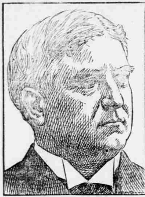
GOV. A. C. SHALLENBERGER. Defeated for Renomination on Democratic Ticket.