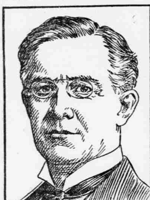
GILBERT M. HITCHCOCK. Congressman Third District, Nominated for U. S. Senator on the Democratic Ticket.

Bryan to Support Hitchcock. Lincoln, Neb.—W. J. Bryan will do everything in his power to assist in the election of Congressman Hitchcock to the United States senate.