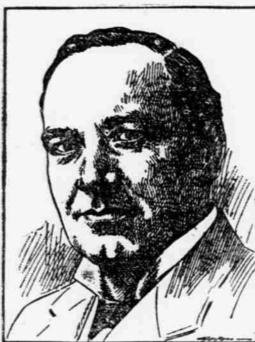
ELMER E. BURKETT. Senior U. S. Senator, Renominated on Republican Ticket.