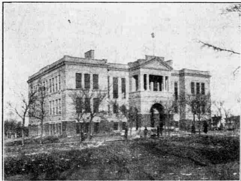
McCook's New High School Building.