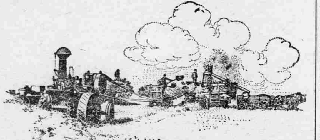
Thrashing No. 1 Hard Wheat in Western Canada.

Fuel is the bugbear of many of the prairie countries. In Western Canada, however, there are but few districts without an ample supply of timber, and as coal of the best quality is everywhere present no farmer being more than 200 miles distant from a mine, and the price never more than $4.50 per ton to him at his door, it is