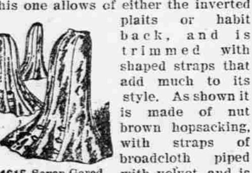
Flare Skirt, 22 to 34 waist.

The seven gored skirt that flares freely and gracefully at the lower portion retains all its vogue in spite of the many novelties introduced. This one allows of either the inverted plaits or habit