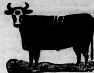
C. D. PHELPS.

In Red Willow County, Nebraska, has been surveyed, and lots in the market for just one year and has now a population of 1000 people. This point has been designated by the C. B. & Q. as the DIVISION STATION between the MISSOURI RIVER & DENVER, where the principal shops, a 15 stall round house and other R. R. facilities have been located on the Denver Line. A complete system of water works costing $25,000 is just being completed giving all the facilities for comfort possessed of old cities. Lots will range in price from $150 to $500 for business lots, and $50 to $200 for residence lots. The history of points like McCook show an increase of more than three hundred per cent. in from one to five years, and this town promises to be an exceptional chance for investments. For further particulars apply to R. O. PHILLIPS, Or W. F. WALLACE, Secretary, Lincoln, Neb. McCook, Nebraska.