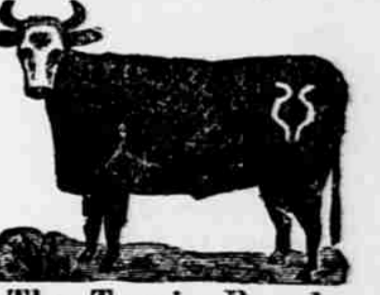
The Turnip Brand.

McCook, Neb., range: Red Willow creek in southwest corner of Frontier county. Also, E brand on right hip and side and swallow-fork in right ear. Horses branded E P on right hip. A few branded "A" on right hip. 4