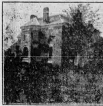
THE NEAL INSTITUTE CO.

The west one half of lots 5 and 6 of block 4 in M. A. West's addition to the city of Broken Bow, Ne-