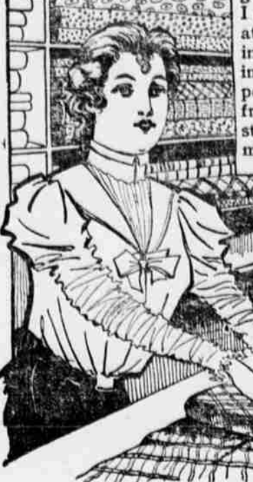
left ovary being so swollen and sore that I could not move without pain. Now, thanks to your wonderful medicine, that tired feeling is all gone, and I am healthy and strong."