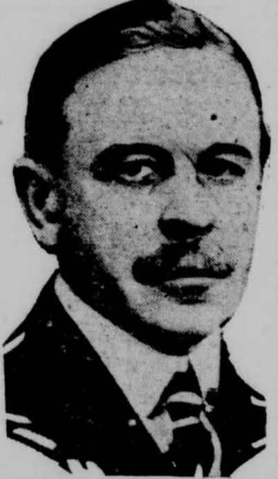
Dr. Hubert Work, postmaster general, is mentioned in well-informed circles in Washington as the man President Harding will select to succeed Alfred B. Fall as secretary of the interior.