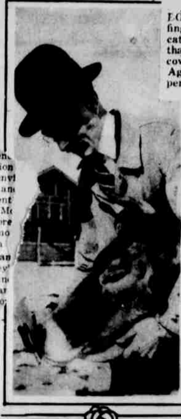
NOSE-PRINTING FOSSY. Adapting the finger-printing idea to the cattleyard—something that will make it hard for cow thieves. A Wisconsin Agricultural College expert takes a print.