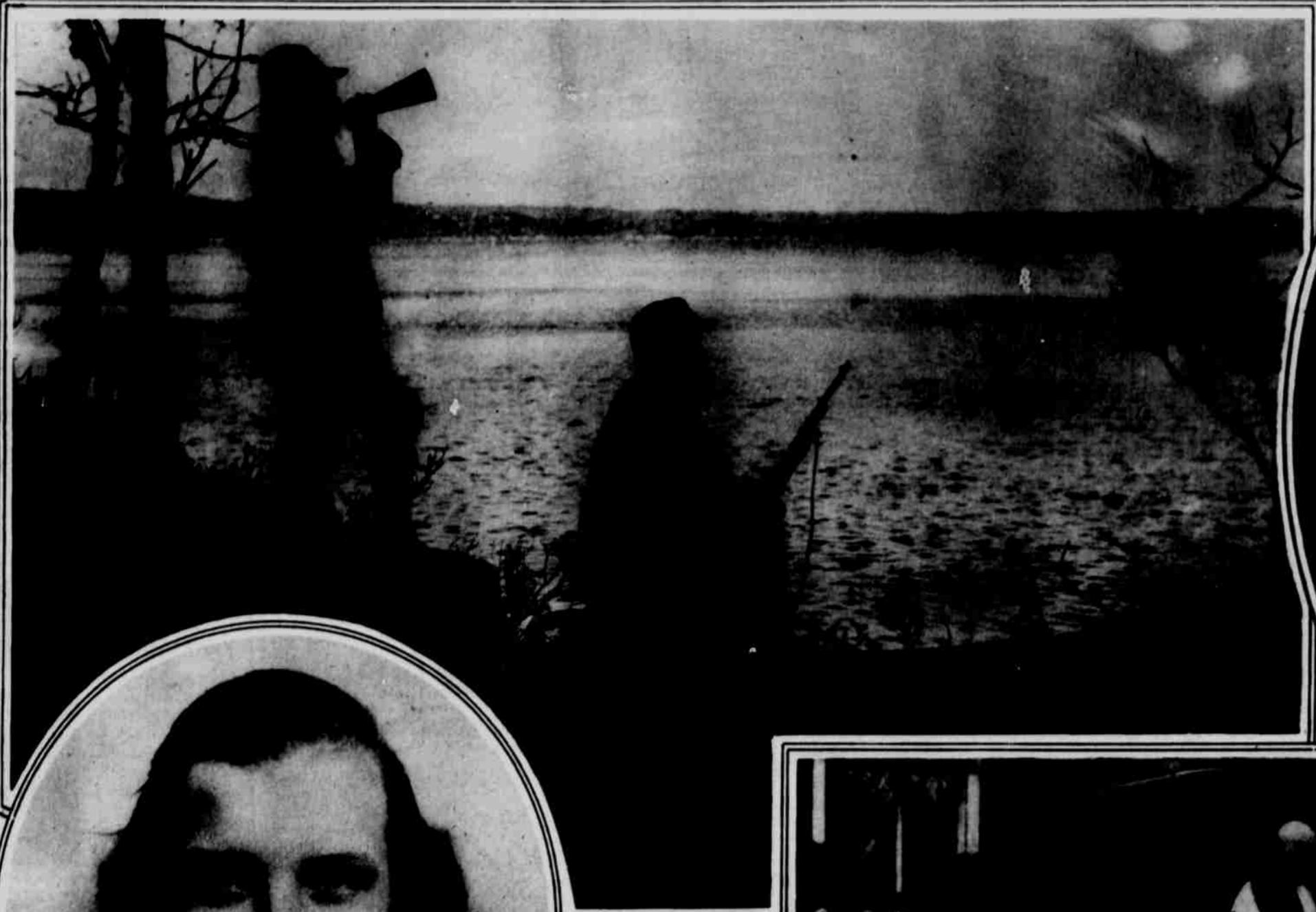
Above: Luring the moose within range—A striking silhouette of the patient hunter on watch while his guide imitates the moose call at Pecos Lake, Nova Scotia.