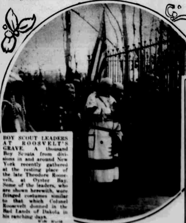
BOY SCOUT LEADERS AT ROOSEVELT'S GRAVE. A thousand Boy Scouts from divisions in and around New York recently gathered at the resting place of the late Theodore Roosevelt, at Oyster Bay. Some of the leaders, who are shown herewith, wear fringed costumes similar to that which Colonel Roosevelt donned in the Bad Lands of Dakota in his ranching days.

MARMOLA COMPANY 225 Garfield Bldg., Detroit, Mich.