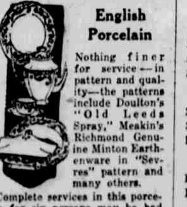
English Porcelain Nothing finer for service—in pattern and quality—the patterns include Doulton's "Old Leeds Spray," Meakin's Richmond Genuine Minton Earthenware in "Sevres" pattern and many others.

Complete services in this porcelain for six persons may be had at prices from $35.00 up.