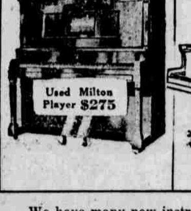
Used Milton Player $275

Any Used Bargain You Purchase From Us This Week Will Be Accepted at Its Purchase Price on a New One at Any Time Within One Year.