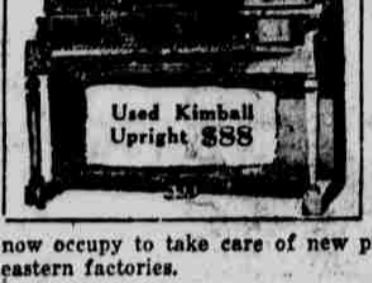
Used Kimball Upright $88

We Have Cut Prices So Low that Every Home Can Own an Instrument