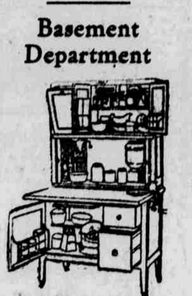
McDougal Kitchen Cabinet , showing complete line of all the new and latest models in oak and white enamel finishes, prices $25.50 to $95.00.