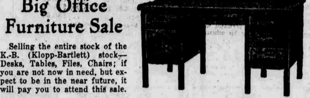
Big Office Furniture Sale Selling the entire stock of the K.-B. (Klopp-Bartlett) stock—Desks, Tables, Files, Chairs; if you are not now in need, but expect to be in the near future, it will pay you to attend this sale.