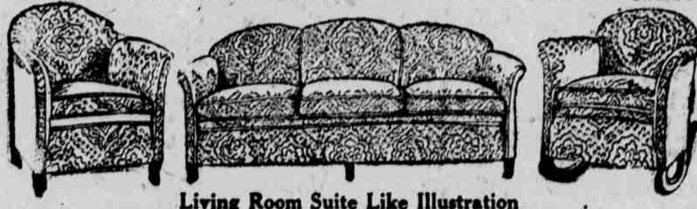
Living Room Suite Like Illustration One of the many exceptional values in over-stuffed living room furniture; built in our own factory specially to our order. Note graceful, thin arm and loose spring seat construction. Built with full web bottom, supporting resilient and durable hand-tied spring foundation. Shown in rich blue and taupe velour, priced as follows: Davenport, $78.50; Arm Chair, $45.00; Arm Rocker, $46.00. See our three-piece Cane Suites complete at $118.00.

30 Days Free Try before you buy. Any Victrola or Brunswick Phonograph in our stock delivered to your home for 30 days' free use—then pay on our easy purchase plan.