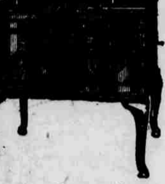
This Queen Anne Brunswick Console Type. All Woods and Finishes. $225.00