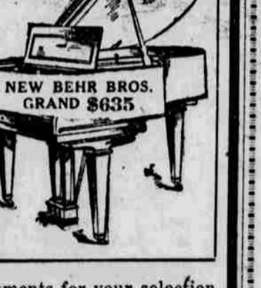
NEW BEHR BROS. GRAND $635

THESE ARE ONLY A FEW OF THE USED BARGAINS WE HAVE FOR YOUR SELECTION