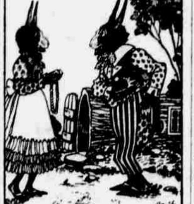
Oh! A necktie! cried Miss Bunny as she took the gift.

By day Jimmy Rabbit spent a good deal of the time sleeping in his form, which was a sort of bed he had hollowed out for himself in the ground.