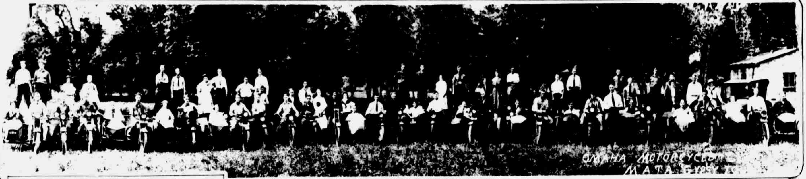
Lake Quinnebaugh, Neb., was the objective this year for the annual summer tour of members of the Omaha Motorcycle club. It was a two-day affair, June 17 and 18. The photograph shows most of the party of 200 who made the trip.